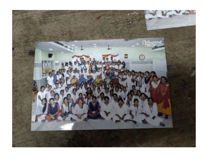
NSS GROUP - GCWK