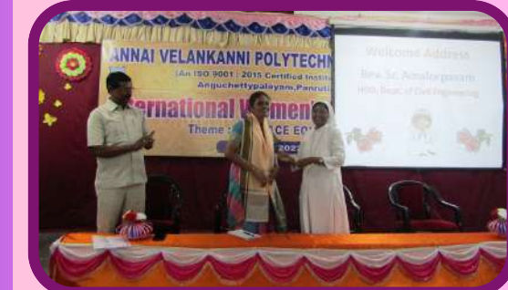
Acted as a Resource Person at Annai Velankanni Polytechnic College, Panruti on 08.03.2021