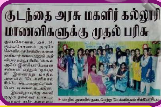
Received First Prize in Kalaka Varanga Tamil Pasanga at Anna Arangam in Thanjavur on 30.09.2023