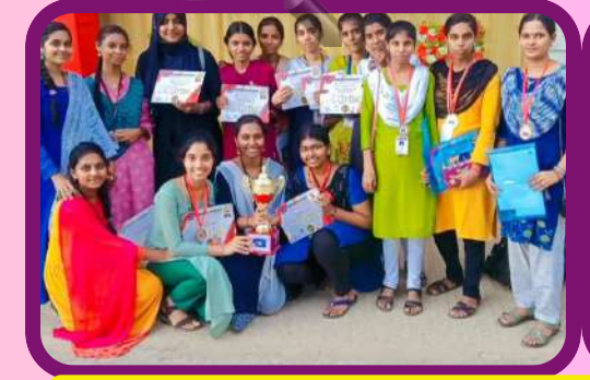
National Level Technical Meet (ITRNIX - 2023) on 05.10.2023 (Received Overall Shield)