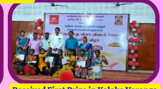
Received First Prize in Kalaka Varanga Tamil Pasanga at Anna Arangam in Thanjavur on 30.09.2023