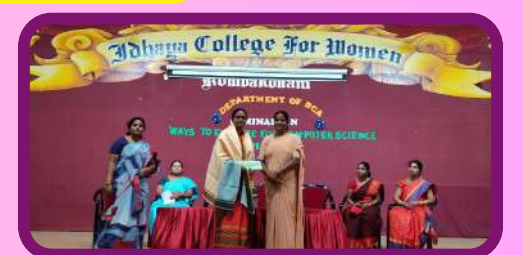
Acted as a Resource Person at Idhaya College for Women, Kumbakonam on 16.12.2021