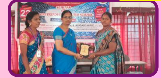
Acted as a Resource Person at Mass College of Arts and Science, Kumbakonam on 22.12.2021